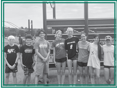
Students from Warwick Valley Central School District worked and volunteered as track coaches for kids between the ages of five and twelve

The 2023 Village of Warwick Recreation Programs had another successful summer with 988 children participating and fifty-two employees hired for eight recreational programs offered.