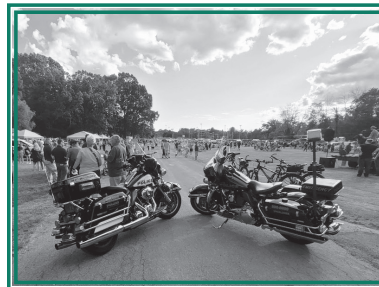
The Warwick Police Dept. had motorcycles and other vehicles on hand.