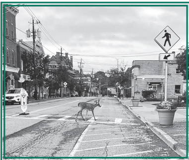
A young buck seen crossing safely in the Crosswalk on Main St.

For centuries, our village roadways have connected people to resources, commerce and community. First forged by native Americans, our roads played a valuable role in the American Revolution as a useful and safe passage way to move troops and supplies through the area. Yes, even George Washington himself is said to have traveled down our Main St.