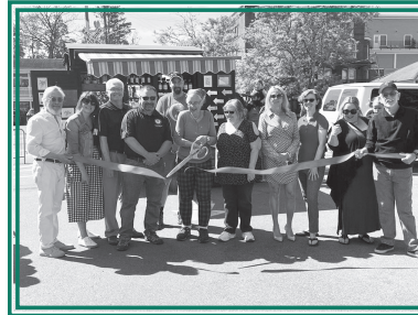
Ribbon Cutting on opening day, Sunday May 14