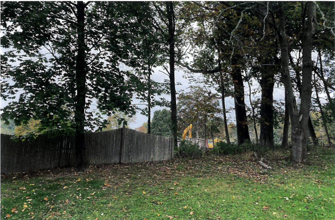
View from boundary of 4 and 6 Benedict Drive, Before & After