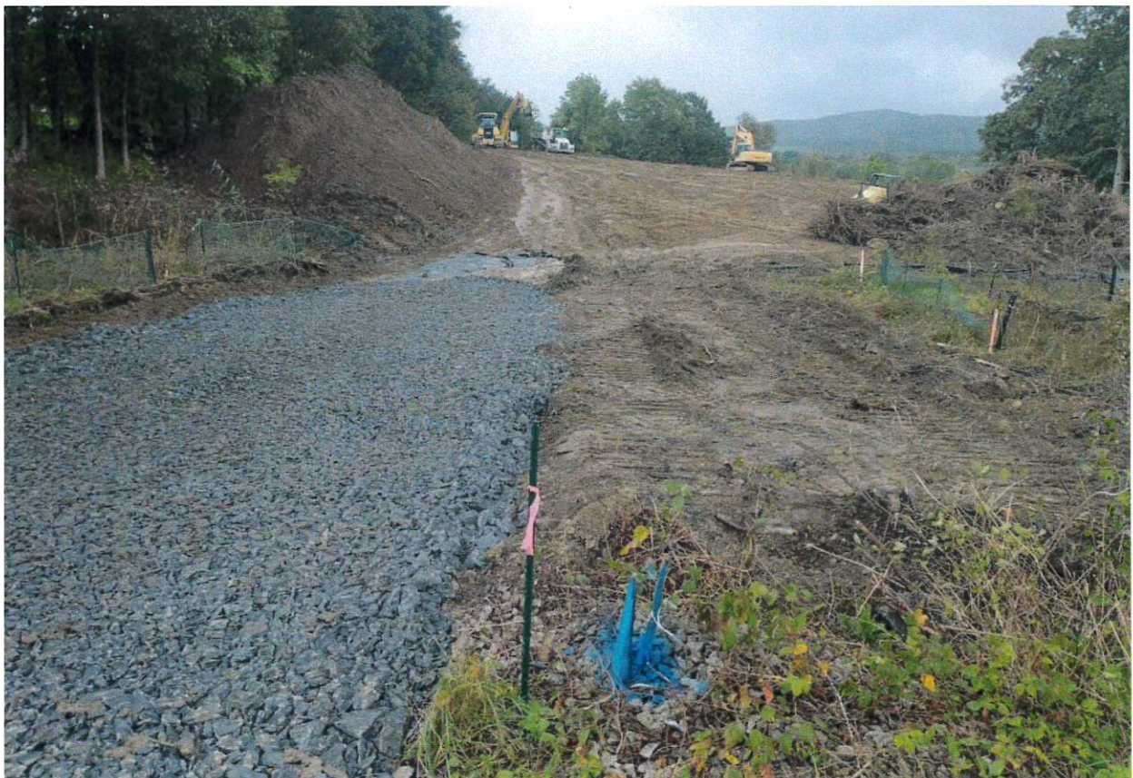
Driveway Crossing Wetland; Area on Right is Approved Wetland Fill from 20 years ago, Area on Left is New Fill.

Also Note No Erosion Control Around Soil Pile and Wetland on Left