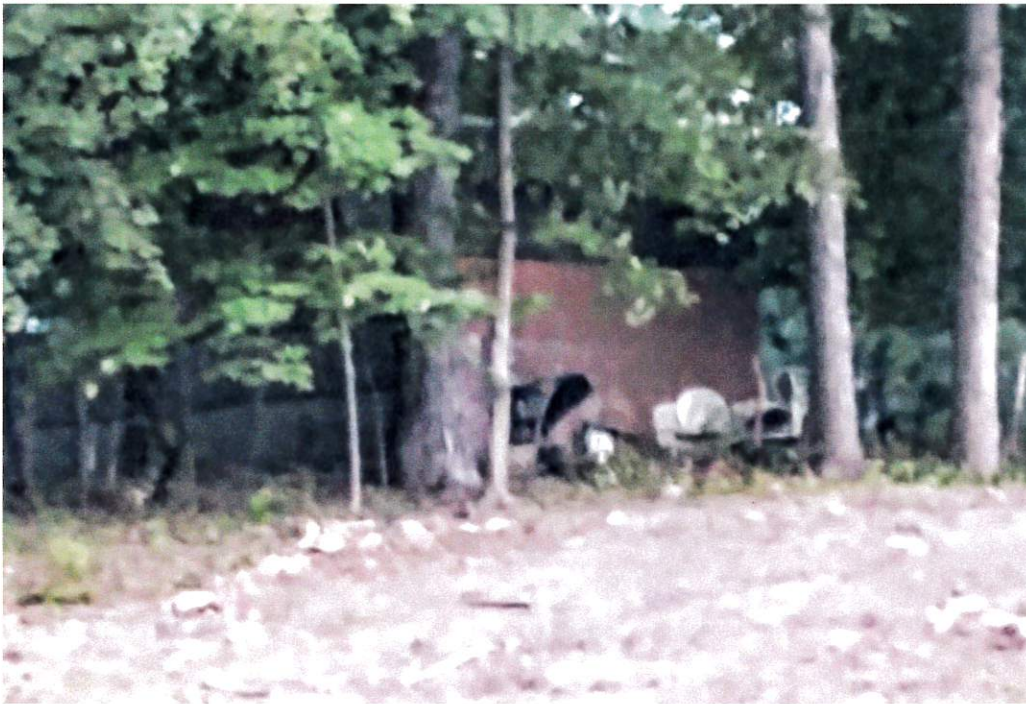
At 4 Benedict Property Line