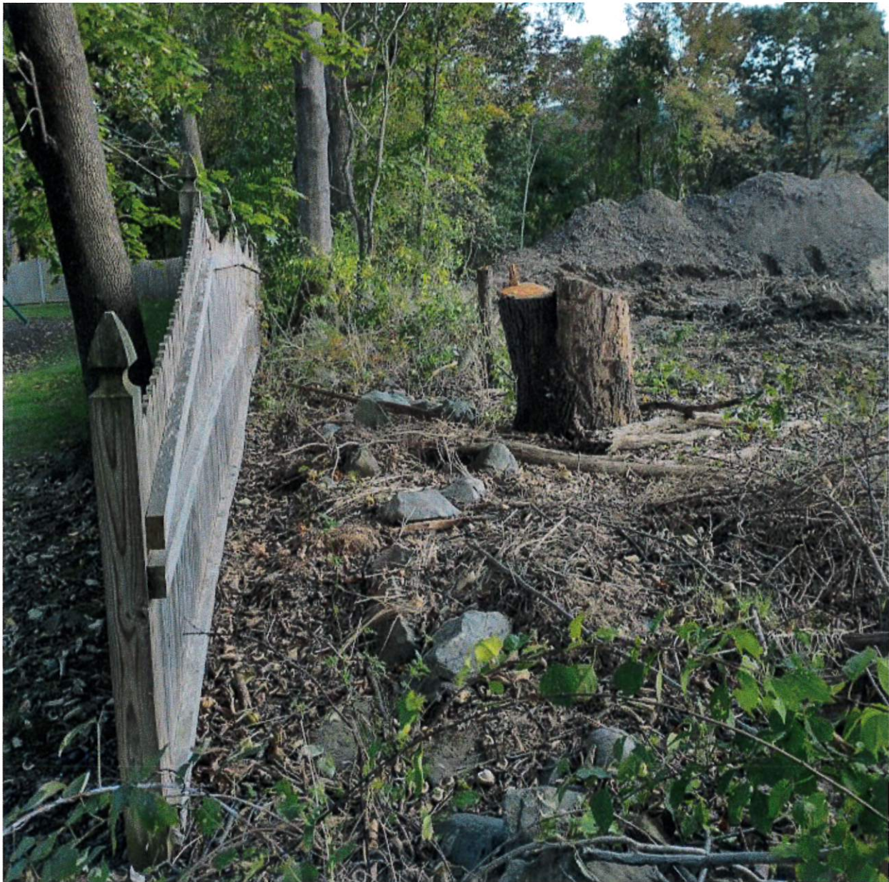
At 6 Benedict Property Line