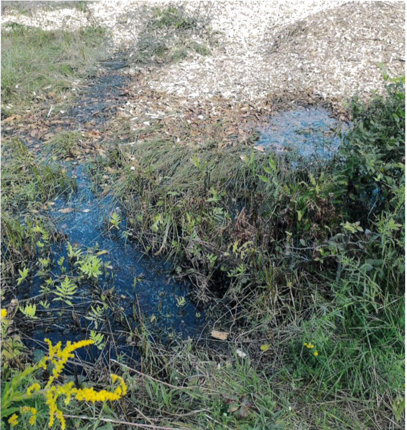
Wetland at edge of 60 Colonial Avenue, Showing Initial Encroachment by Chip Pile