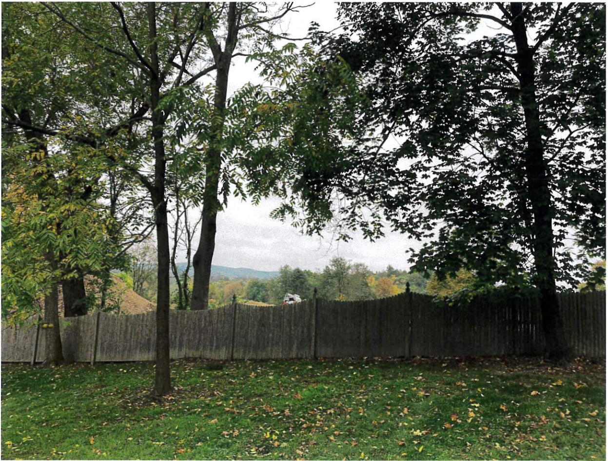
View from 6 Benedict Drive, Before & After