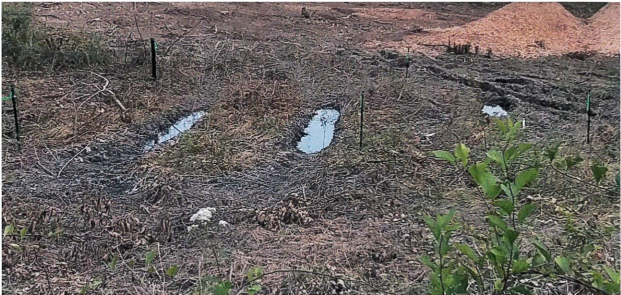
Wetland Destruction from Heavy Equipment Driving Through Wetland