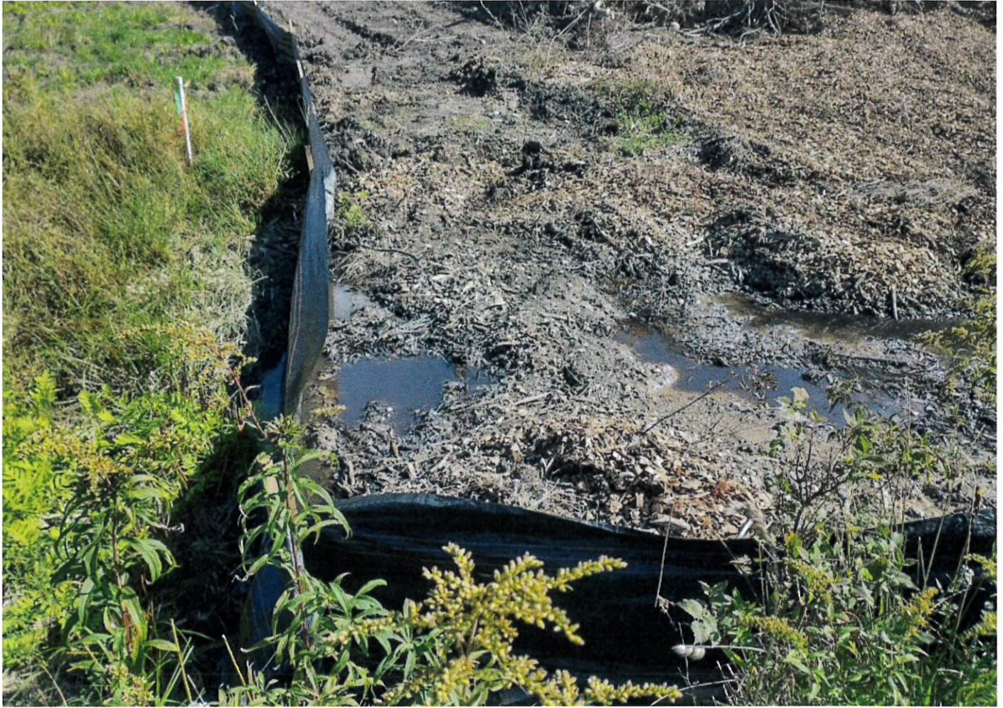
Fill within Wetland up to Silt Fence