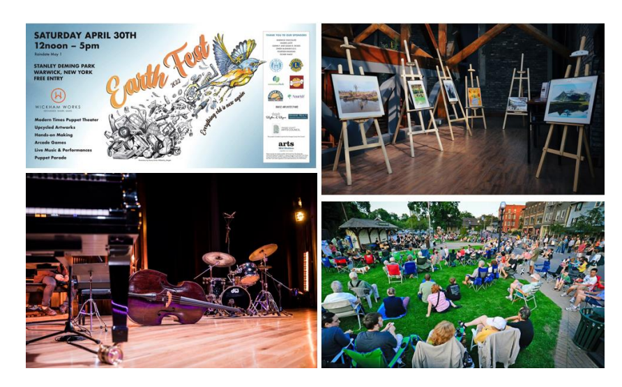
Not only do culture and arts attract visitors to the community, they are an important part of what Village residents do with their time.

GOAL C&C7: FOSTER CONNECTIONS BETWEEN ARTISTS AND THEIR AUDIENCES TO PROMOTE TOURISM AND ENHANCE QUALITY OF LIFE IN THE VILLAGE