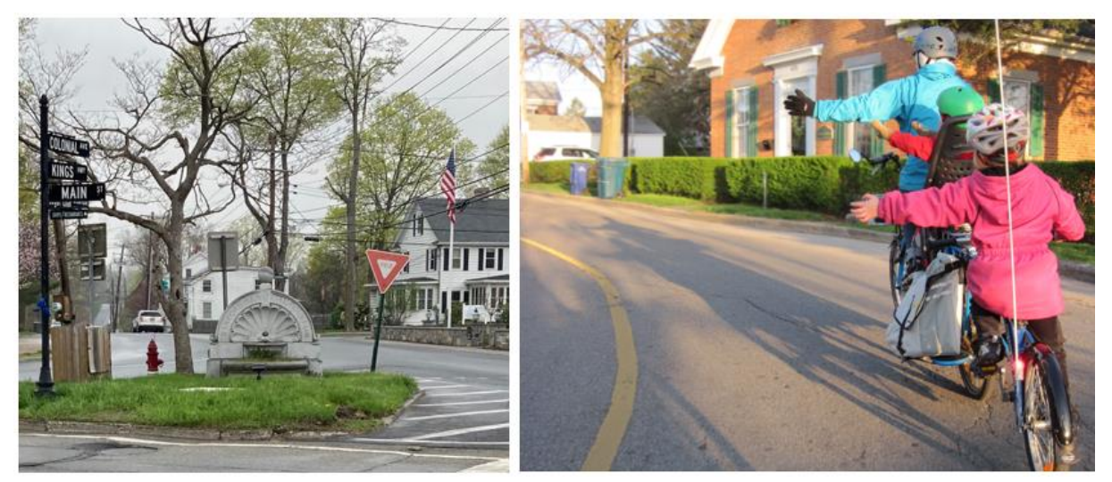
A well-connected community will emphasize opportunities for walking and cycling for all residents and visitors as well as a well-maintained road network.

GOAL C3: FOCUS NEW INVESTMENTS IN PARKS AND RECREATION ON IMPROVING FLEXIBLE OUTDOOR RECREATION SPACES, ACTIVE TRANSPORTATION CORRIDORS, AND TRAILS.