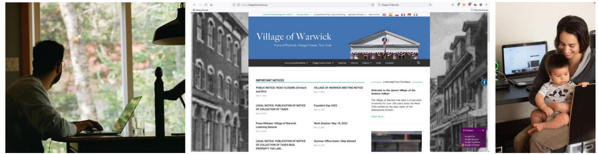
Connectivity also extends to the digital realm, ensuring all residents and businesses have high speed access to the Internet.

GOAL C4: Ensure that affordable broadband Internet is available throughout the Village.